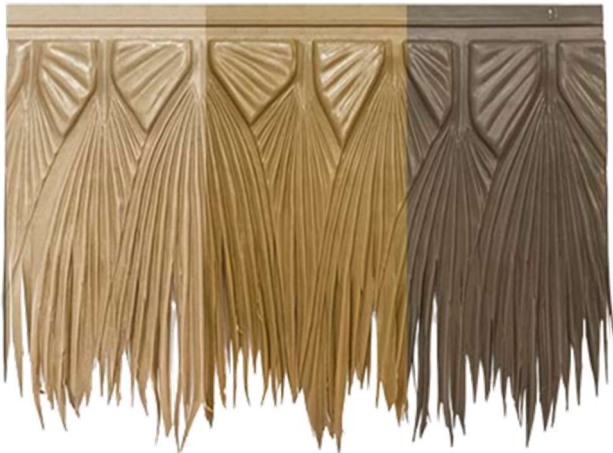
Color (Weathered, Sundried, Aged)